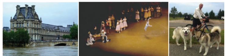
The Louvre and the flooded Seine, 6 m above its usual level.

It is often said that a student's favorite day of school is the last day of the year, but their second favorite is the first. It is probably much the same for teachers. Happy second-favorite-day-of-the-year everyone.